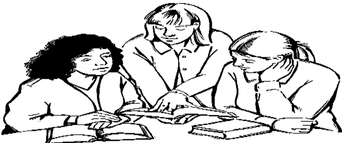
Women's Bible Study